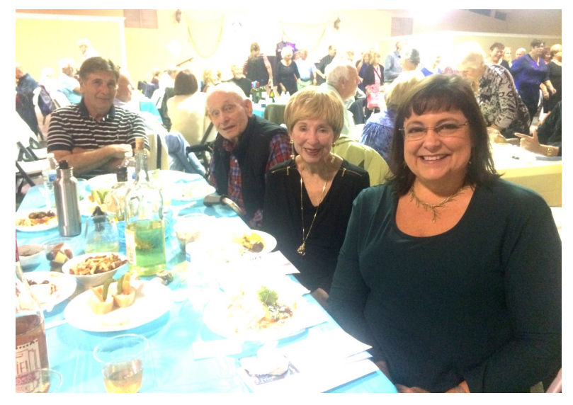
The Quave family is having a delightful time.